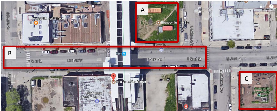
Figure 3: 51 st St Potential Projects: A – container top gardens at Boxville; B – tree plantings along 51 st St; C – stormwater management feature at the Bronzeville Community Garden