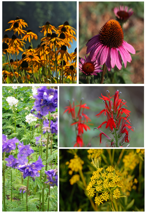
Black-eyed Susan. Purple Cone Flower. Jacob's Ladder. Cardinal Flower. Golden Alexander.