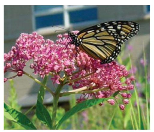
A monarch butterfly rests on a milkweed flower

For more information visit rainready.org or contact info@rainready.org .